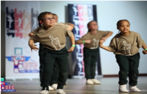
Giving your best